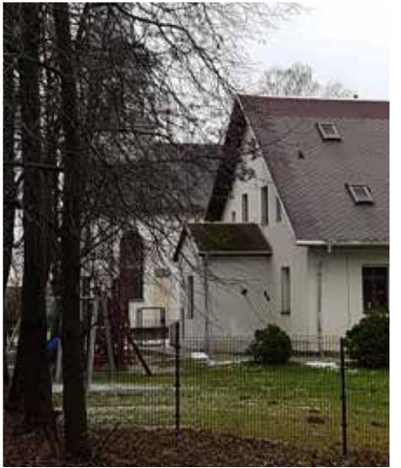
Rebuilding and also new houses for more children, at the moment 50.

children from families who suffer various difficulties most of which are alcohol abuse, psychological or physical violence. By the side of the children's home is the church that is built in stone. During the Russian occupation, the church was used as sports hall for soldiers but now renovated and serving as a church again. The vice Chancellor have visited the Orphanage several times.