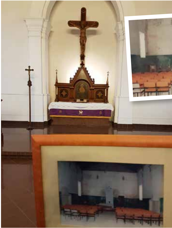
The church used for sports – now back in use as a Church

This year the help from OCM is part of a newly installed Priest living at the center and an important male road model for the young boys and girls. In the foster homes the young people are organized as families. In every family, four employees help children with their homework, develop their social skills. Sometimes, children who come to foster home, have neither hygienic nor social skills, do not know how to use WC, shower, cannot tidy their wardrobes, make beds, clean rooms, wash clothes, cannot cook simple meals, use kitchen appliances, plan their expenses. They learn all these skills at their new home.