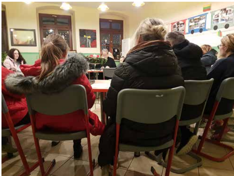
All children meet with Priest and staff daily for short Bible studies and discussion.

The daily activities and thoughts are forwarded to the goals that children and people with disabilities stay happy in the orphanage. They are sincerely happy and thankful that the help of our Order supports their dreams to become reality. It is unspeakably important and unmeasurable. To all OCM members they express their sincere thankfulness for the manifold support to their parish.