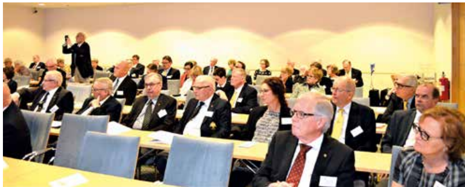
The Knight's Forum of the Convention gathered a large and active audience.