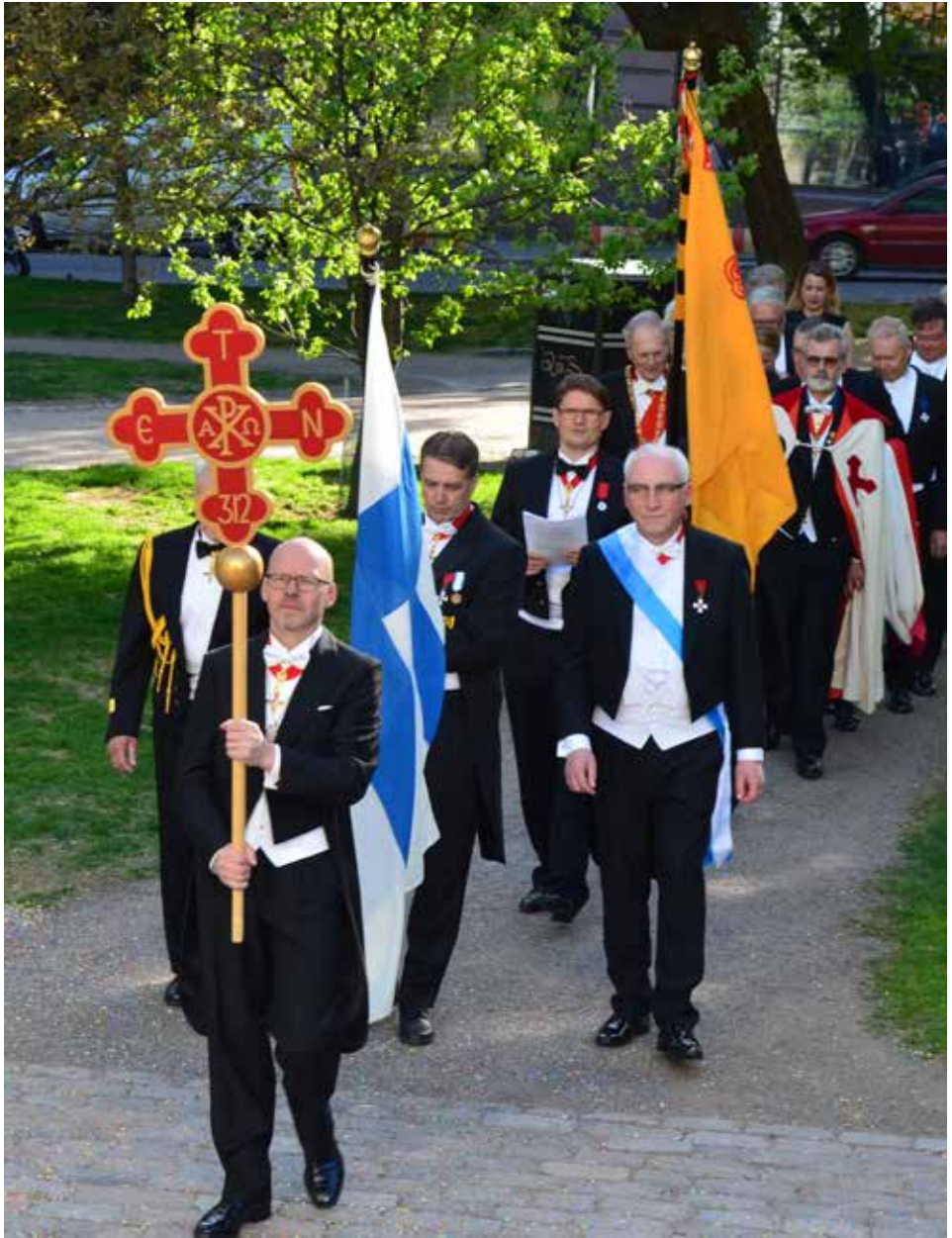
The procession of the Investiture arrives to the lutheran Old Church of Helsinki.