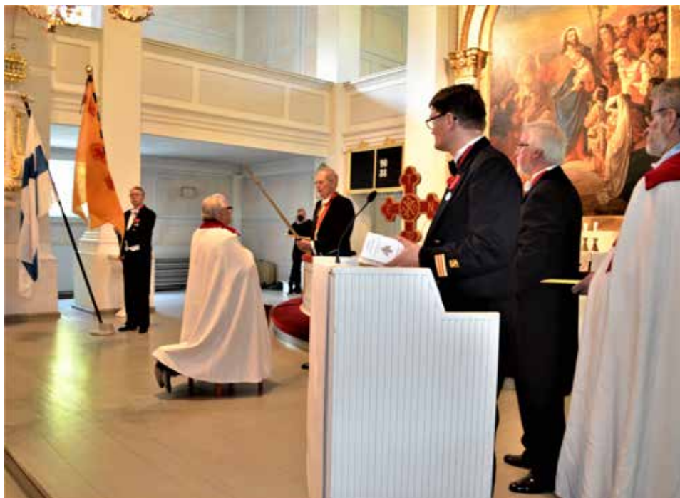
Master of the Order dubbed the new knights in the traditional way.