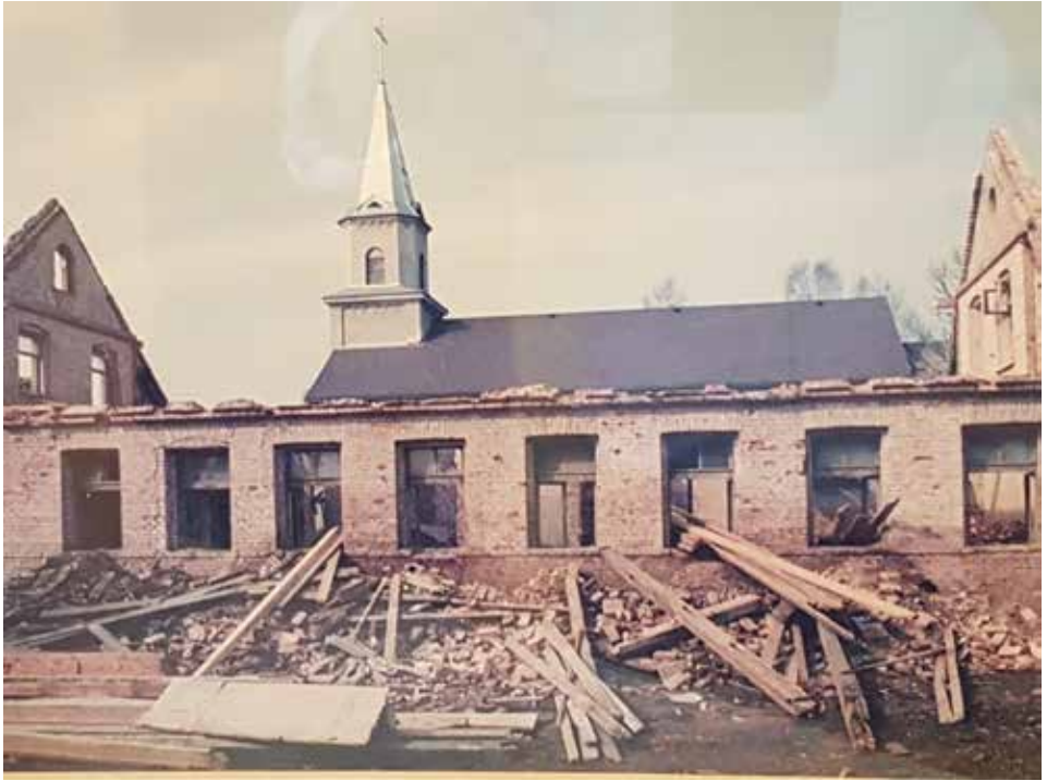
The place was earlier used by Russian troops.