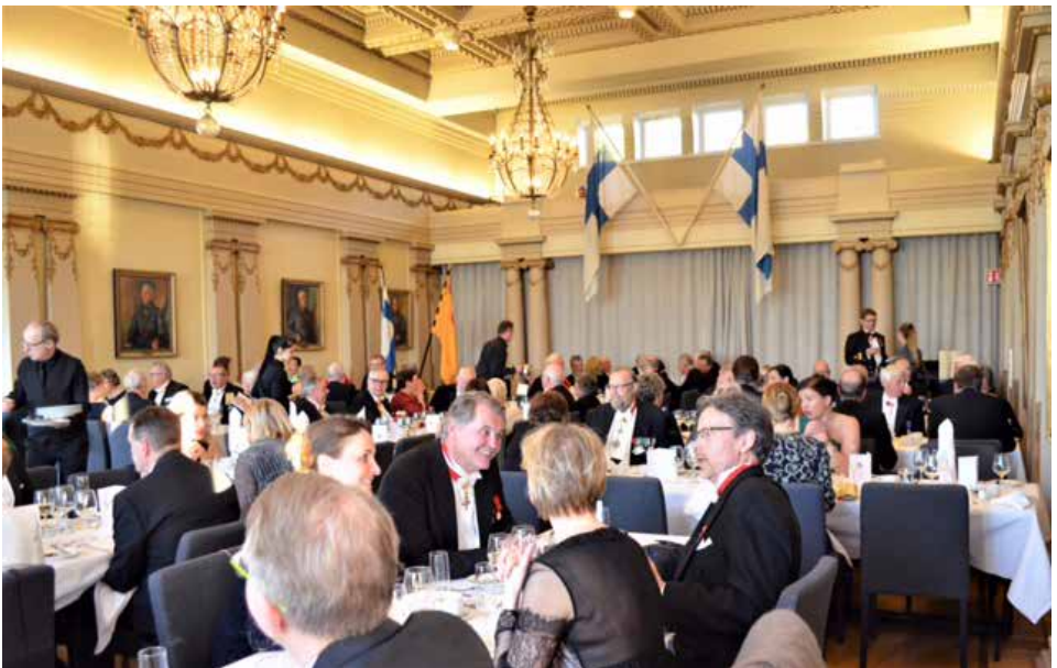
Restaurant Katajanokan Kasino, offered a solemn setting to the warmhearted banquet.