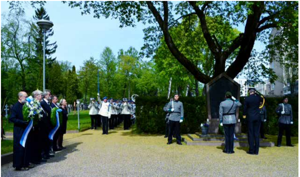
A guard of honour and military band honoured the wreath laying at the Orthodox Heroes Cemetery.