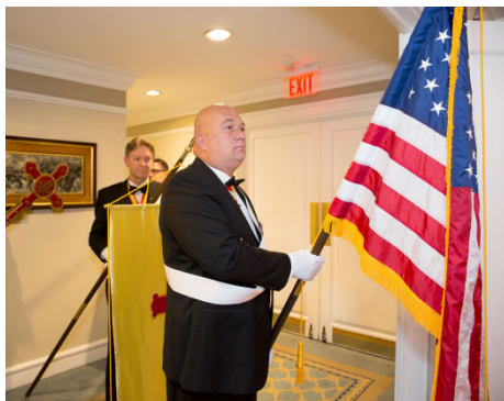
The Procession Forms in the Hallway and includes the new Cross of Constantine.