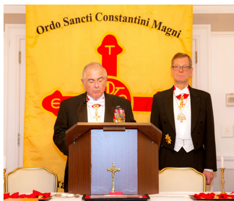
The Chancellor and Exarch of the USA co-host the Ceremonies.

At 1400 PM, the Chancellor joined the Exarch and selected members of his staff to conduct a rehearsal of the events that would occur during the Divine Liturgy