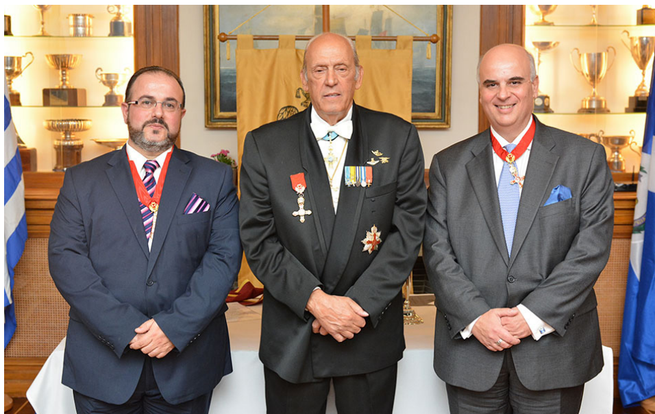
Hellenic Exarchate's Exarch, with the two new Knights