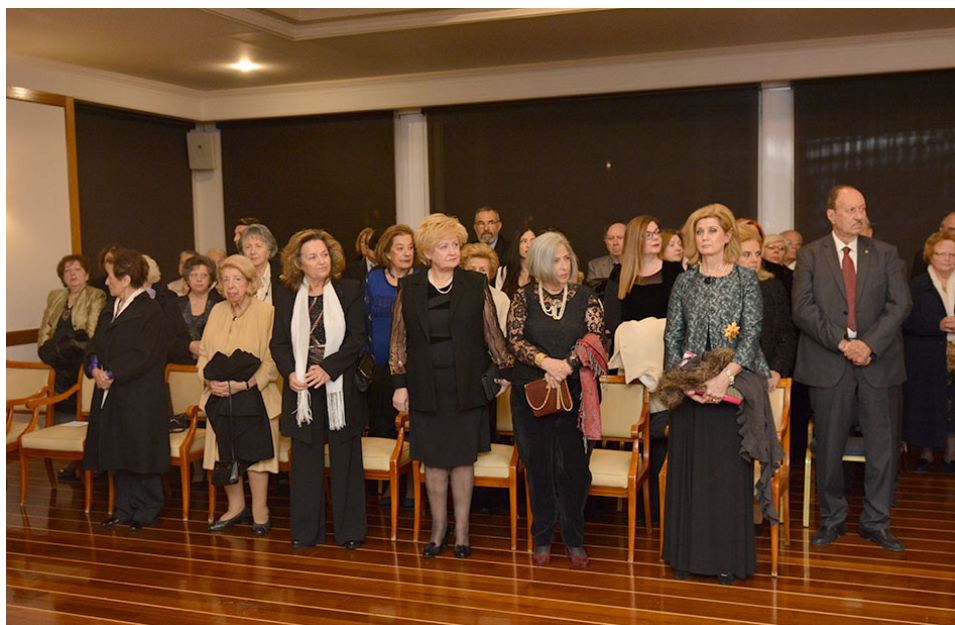
Relatives and friends of the Exarchate's members