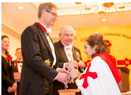
The Dubbing and Presentation of Cross of Constantine.