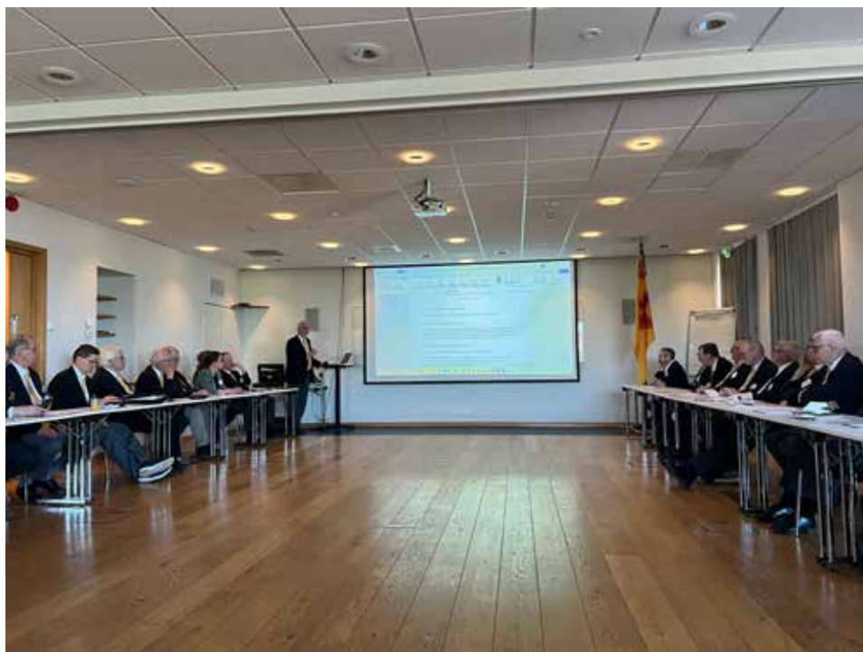
The annual meeting of the Exarchate of Finland is underway. The secretary presents the Annual report for 2025.