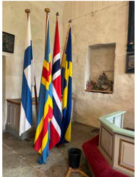
The flags in the church said that the Knights' Days were also Nordic this time.