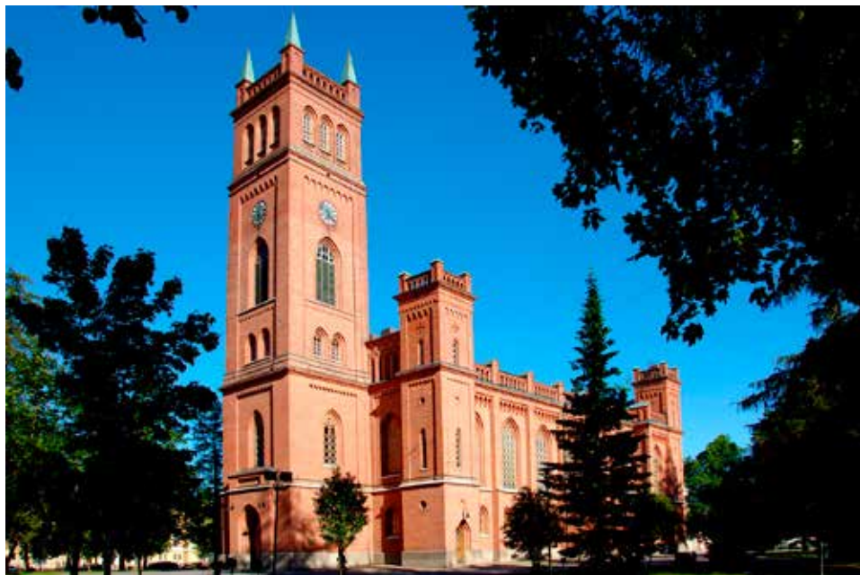
Vaasa Church was the center of the Knighting Days