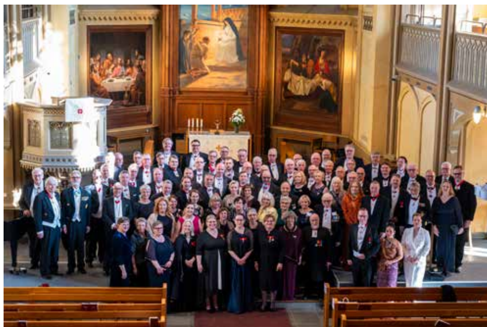
Participants of the Knighting Days in a group photo at Vaasa Church