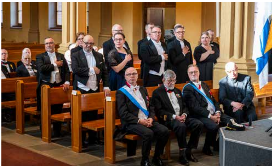
Oath of new knights and dames.