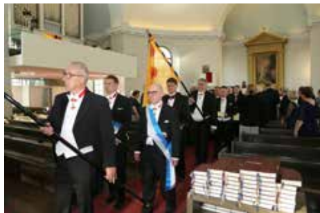
The promotion procession leaves the church, the event is over.