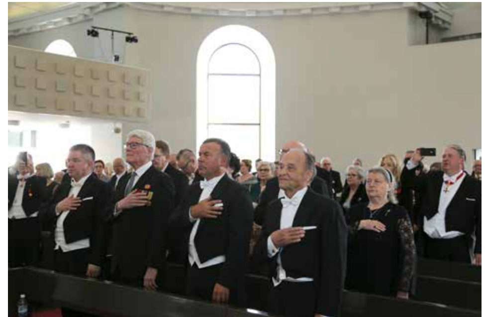
Oath of new knights and dames.