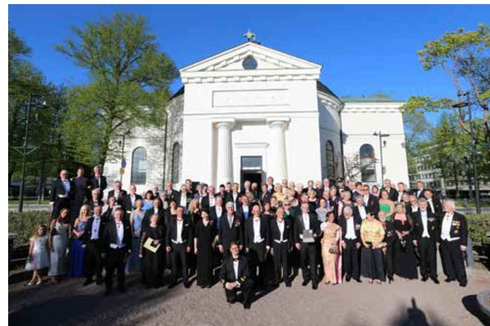
Participants in a group photo in front of Hämeenlinna's main church.