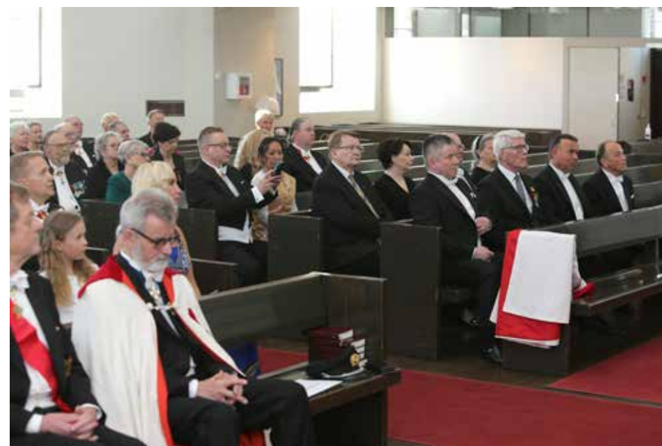
In the church before the start of the promotion. On the right, in two rows, new knights and dames